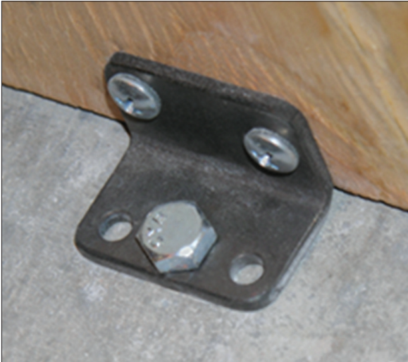
Fig. 1 The shutter is firmly attached to a concrete floor with a Bottom Brace using a 1/4"/6.4mm lag screw into an expansion anchor. The brace can be stored attached to the shutter and the lag screw closes the anchor hole in the floor when not in use. Also works for wood floors using panhead machine screws.

The Norse Bottom Brace shown here is designed to work with hurricane panels (plywood or other materials) to 3/4"/19mm thick. RECOMMENDED PANEL THICKNESSES: 3/4"/19MM. MINIMUM RECOMMENDED PANEL THICKNESS: 5/8"/16MM