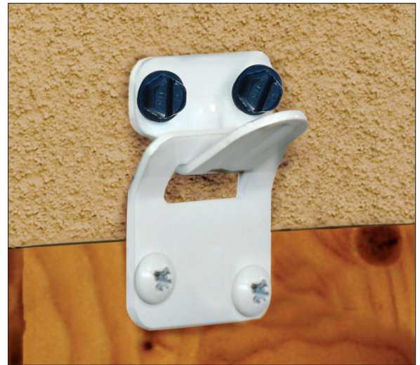
Fig. 1 Here the Norse hook and hanger supports a plywood panel mounted flush inside the window frame.

The panel is now supported, allowing the Norse Hurricane Latches to be fastened with ease.