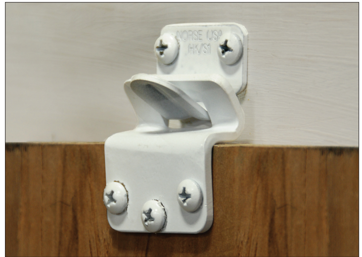
Fig. 1 The Norse hook and hanger supports a plywood panel surface-mounted against the window frame face

The panel is now hung, allowing the Norse Hurricane Latches to be mounted with ease.